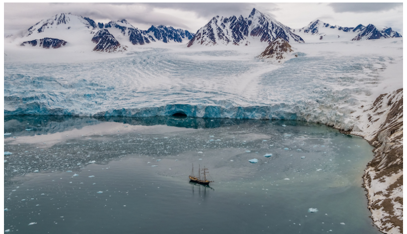
Svalbard archipelago “Nothing but ice, sea and sky”

Lynne continues to despair about the world and its future; however, she has come to realize that “ We Can All Do Something and Make a Difference! ” Unfortunately, Canada is a climate-change laggard and with all its big cars and houses and high fossil-fuel consumption, it is one of the worst on the globe. The economy and politics are strongly linked; however, we need to know that we can live on renewable energy with very little need for subsidies.